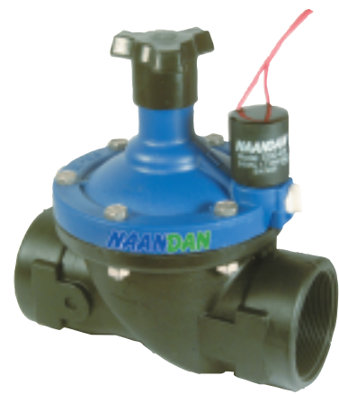
3/4" & 1"